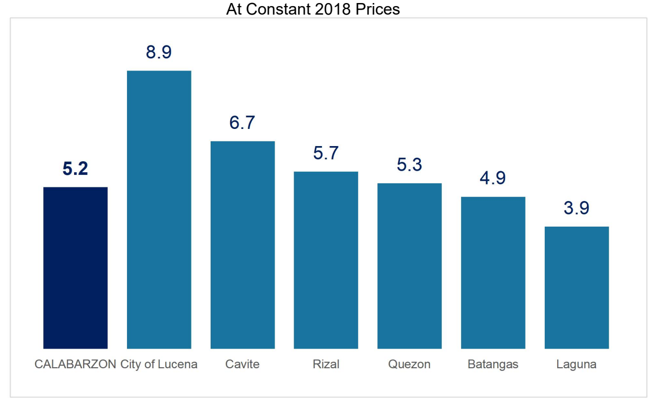
Figure 2. Comparison of Economic Growth in CALABARZON, by Province/HUC In Terms of Growth rates (in Percent); 2022 to 2023

Full data series, charts, and data visualizations of the results of the Provincial Product Accounts (PPA) of City of Lucena can be accessed at the PPA landing page of the Philippine Statistics Authority (PSA) (psa.gov.ph/statistics/ppa), and the PSA Regional website (rsso04a.psa.gov.ph/statistics/ppa).