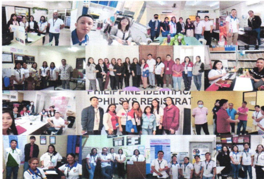
PhilSys RCSs with DSWD City/Municipal Link

The Philippine Statistics Authority (PSA), as the lead implementing agency for the registration and issuance of the Philippine Identification System (PhilSys) has partnered with the Department of Social Welfare and Development (DSWD) on the conduct of the PhilSys registration and authentication during the Family Development Sessions (FDS).