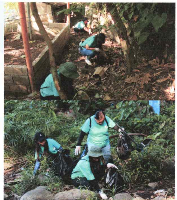
PSA-Quezon Provincial Statistical Staff during their river clean-up and tree planting activity in Brgy. Tongko, City of Tayabas, Quezon.

Complementing the tree planting, the River Clean-up Drive focused on the immediate task of removing trash and debris from the waterways of Barangay Tongko. Beyond the physical clean-up, the objective was to identify the sources of litter, encourage behavioral changes that reduce pollution, and raise broader awareness about the pervasive issue of marine and freshwater debris. This hands-on activity directly addressed the conservation of the planet's vital ecosystems, ensuring cleaner, healthier water bodies.