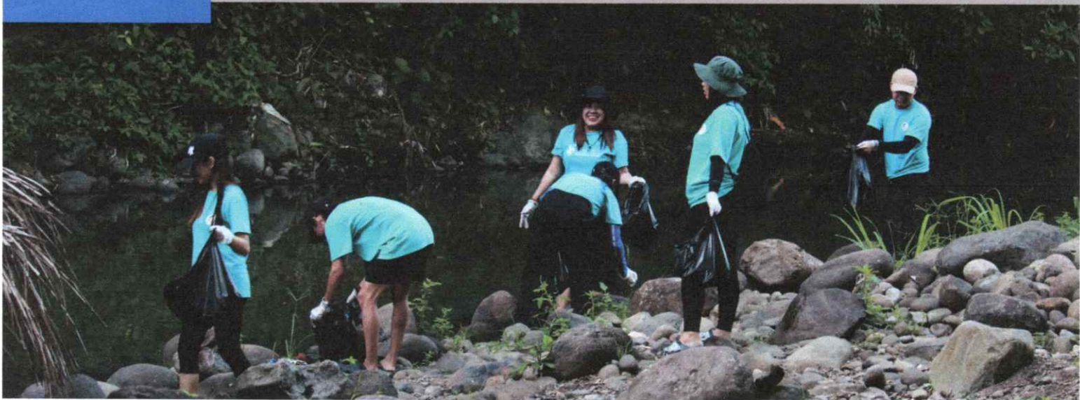
PSA-Quezon Provincial Statistical Staff during their river clean-up in Brgy. Tongko, City of Tayabas, Quezon.