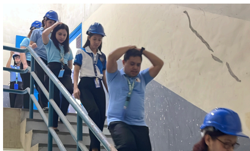
PSA Quezon employees conducted a building evacuation exercise during the National Earthquake Drill.

In a continuing commitment to strengthen disaster preparedness across the nation, the Philippine Statistics Authority (PSA) Quezon Provincial Statistical Office successfully participated in the Second Quarter National Simultaneous Earthquake Drill (NSED). The exercise took place on June 19, 2025, at 9:00 AM, at the provincial office in Pacific Mall, Lucena City.