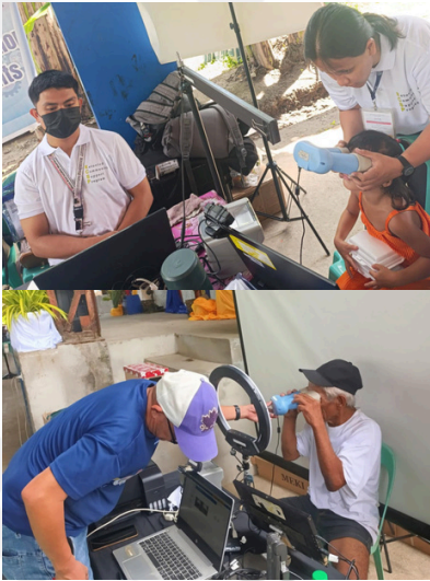
National ID team registered residents during the Retooled Community Support Program (RCSP) Serbisyo Caravan.

By strategically bringing these vital services to local barangays, the PSA significantly reduced the burden of long-distance travel for residents, often a major deterrent to accessing government programs. This impactful collaboration between PSA Quezon and the DILG's RCSP underscores a shared dedication to ensuring all citizens have equitable access to essential government services, fostering inclusivity and sustainable development within the province.