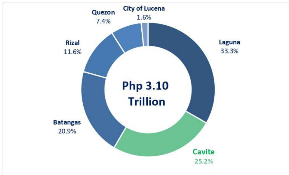
Figure 2. Gross Regional Domestic Product, by Province/HUC In Terms of Share to GRDP (in Percent) At Constant 2018 Prices, 2023

In CALABARZON, Cavite was the second largest economy with a share of 25.2 percent of the Gross Regional Domestic Product (GRDP), estimated at PhP 3.10 trillion in 2023. Laguna was the largest with 33.3 percent share. (Figure 2)