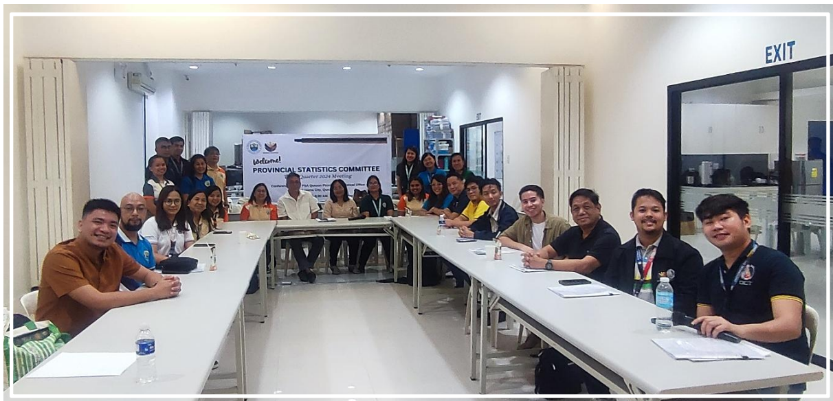
Committee members and representatives of PSC Quezon gathered for a group photo during the 3 rd quarterly meeting at the PSA-Quezon Provincial Statistical Office.

System (POPCEN-CBMS); (d) Updates on the Philippine Identification System; (e) eLGU BPLS Features and Implementation Status in Quezon; (f) Prices and Inflation Rate in Quezon and Lucena City; (g) Preliminary Results of Labor and Employment Survey (April Round); (h) Peace and Order Situation, and (i) Data on Agriculture.