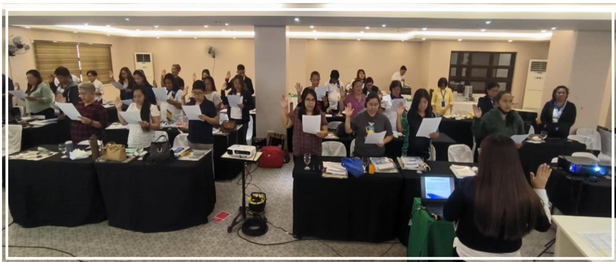
The hired field personnel take the Oath of Data Privacy to ensure the confidentiality of the data to be gathered in the conduct of the 2025 ULAFO-LFMLC.

The Computer Assisted Personal Interviewing (CAPI) data collection method will be employed for ULAFO-LMFLC with the use of the tablet.