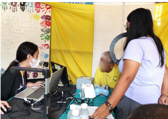
During the PhilSys registration of Gumaca Persons Deprived of Liberty (PDL).

The Philippine Statistics Authority Quezon Provincial Statistical Office conducted mobile acceptance of applications for civil registry documents and PhilSys Registration for the Persons Deprived of Liberty (PDL) in coordination with the Bureau of Jail Management and Penology. This is in line with their celebration of Community Relations Service Month, which is bannered with the theme, "Nagkakaisang Kawanihan at Pamayanan tungo sa Bagong Pilipinas".