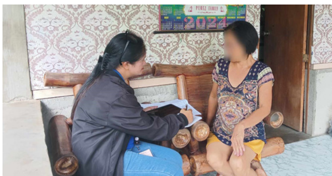
PSA Quezon's hired data collectors officially started the field enumeration for the 2023 HECS field operation in Quezon province last June 18, 2024.

The Philippine Statistics Authority (PSA) - Quezon Provincial Statistical Office conducted the 2023 Household Energy Consumption Survey (HECS). This nationwide undertaking was a joint statistical activity by the PSA and the Department of Energy that aims to generate comprehensive and reliable information on household energy consumption, practices, and preferences. The survey was also a major component of the Comprehensive Regional Energy Study project.