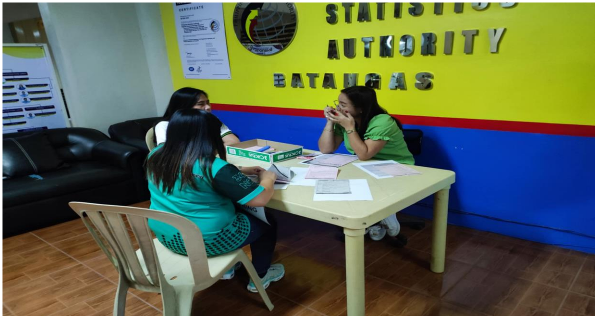
A PSA Personnel screening the application requirements for the requested civil registry documents.

Civil Registration System (CRS) mobile outlet is a mobile service that provide access in securing civil registration documents directly in areas or LGUs far from Civil Registration Outlet. The service aims to improve accessibility in obtaining civil registration documentation. The Civil Registration System (CRS) Mobile Outlet will cover the Region – IVA CALABARZON.