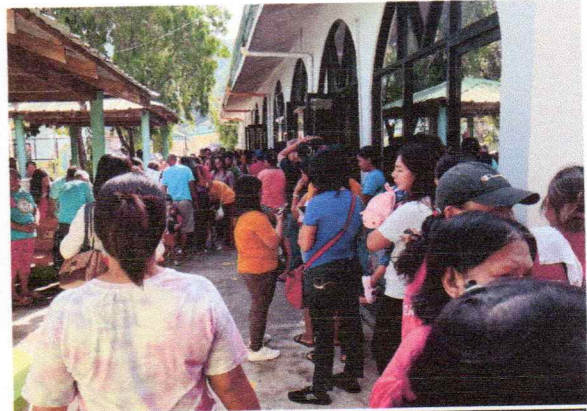
DSWD 4Ps beneficiaries from different barangays in Tingloy, Batangas lined up to the DSWD Systems Caravan. Others completed their national ID registration and request for their ePhilID

On November 8, 2024, the Department of Social Welfare and Development (DSWD) conducted a successful Systems Caravan at Tingloy Central School in Poblacion 14, Tingloy, Batangas. Beneficiaries from various barangays in the municipality gathered at the event to address questions regarding their 4Ps benefits and to complete National ID registration. This caravan is part of the ongoing collaboration between DSWD Pantawid Pamilyang Pilipino Program (4Ps) and the Philippine Identification System (PhilSys) to ensure accessible and convenient National ID registration for all beneficiaries.