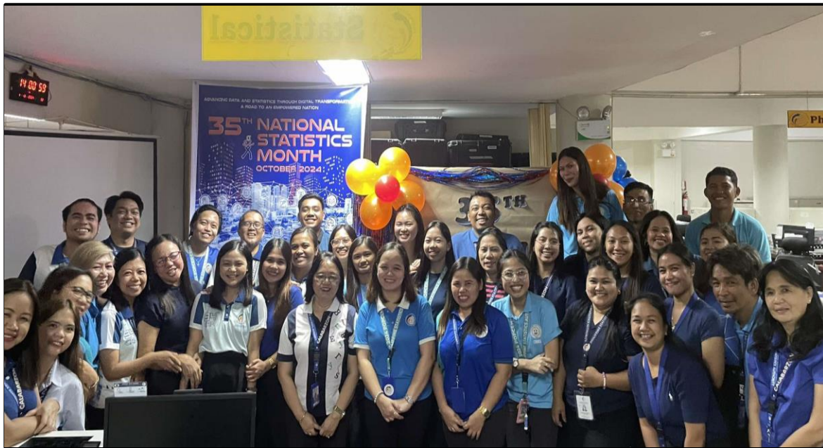
35 th NSM Opening Ceremony. The photo includes the PSA Batangas personnel.

Date of Release: 02 October 2024 Reference No. 2024-024