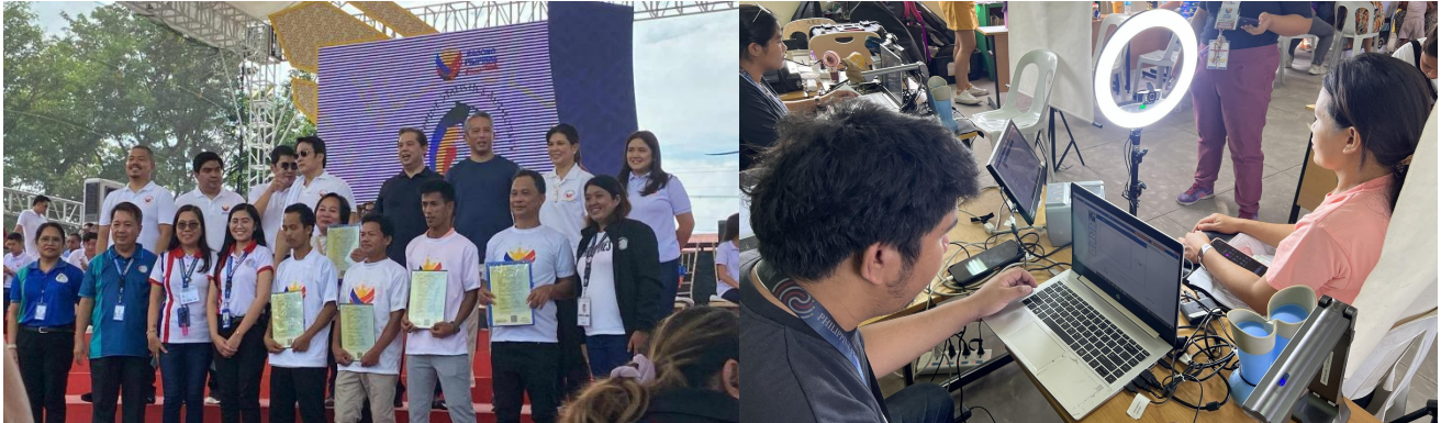
Awarding of Birth Certificate to the Birth Registration Project Beneficiaries during the BPSF Ceremonial Turn-over

Date of Release: 30 September 2024 Reference No. 2024-0400-PR45